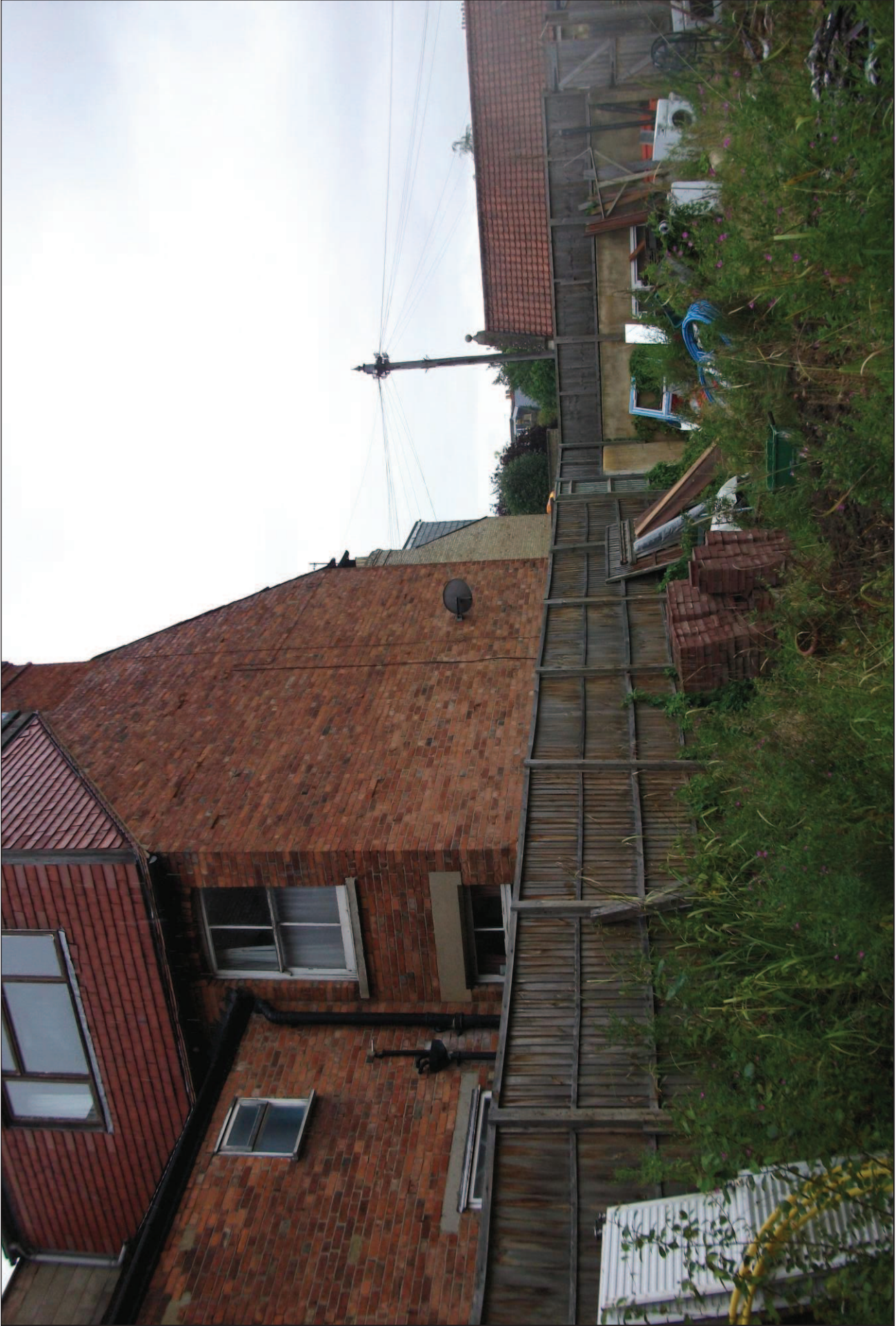
View from inside site to rear of 229 Cowley Road, looking towards 1 Bartlemas Road