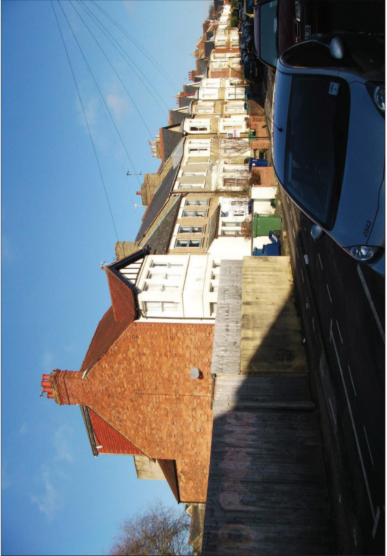
View of adjoining Bartlemas Road properties