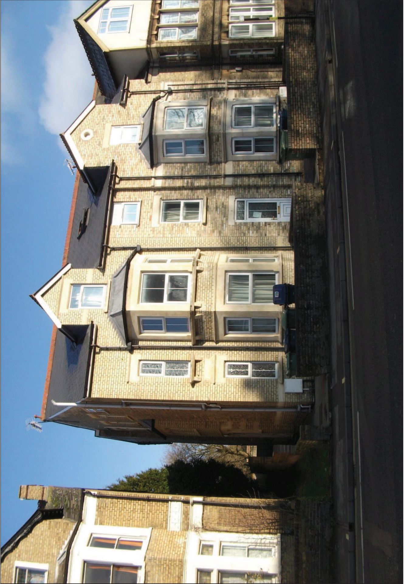
View of front of 229 Cowley Road