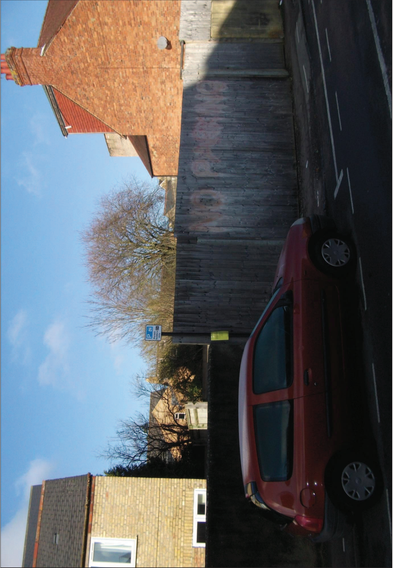
View of site to rear of 229-233 Cowley Road from Bartlemas Road