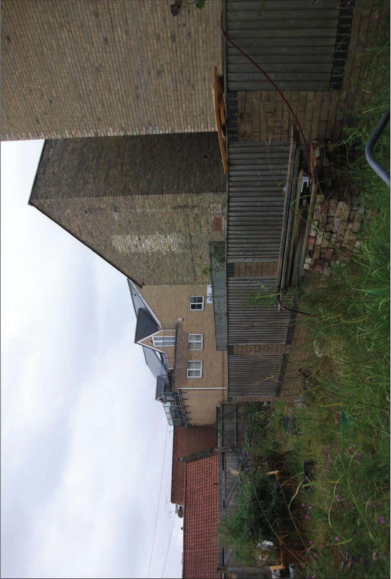
View from inside site to rear of 229 Cowley Road, looking towards Bartlemas Road