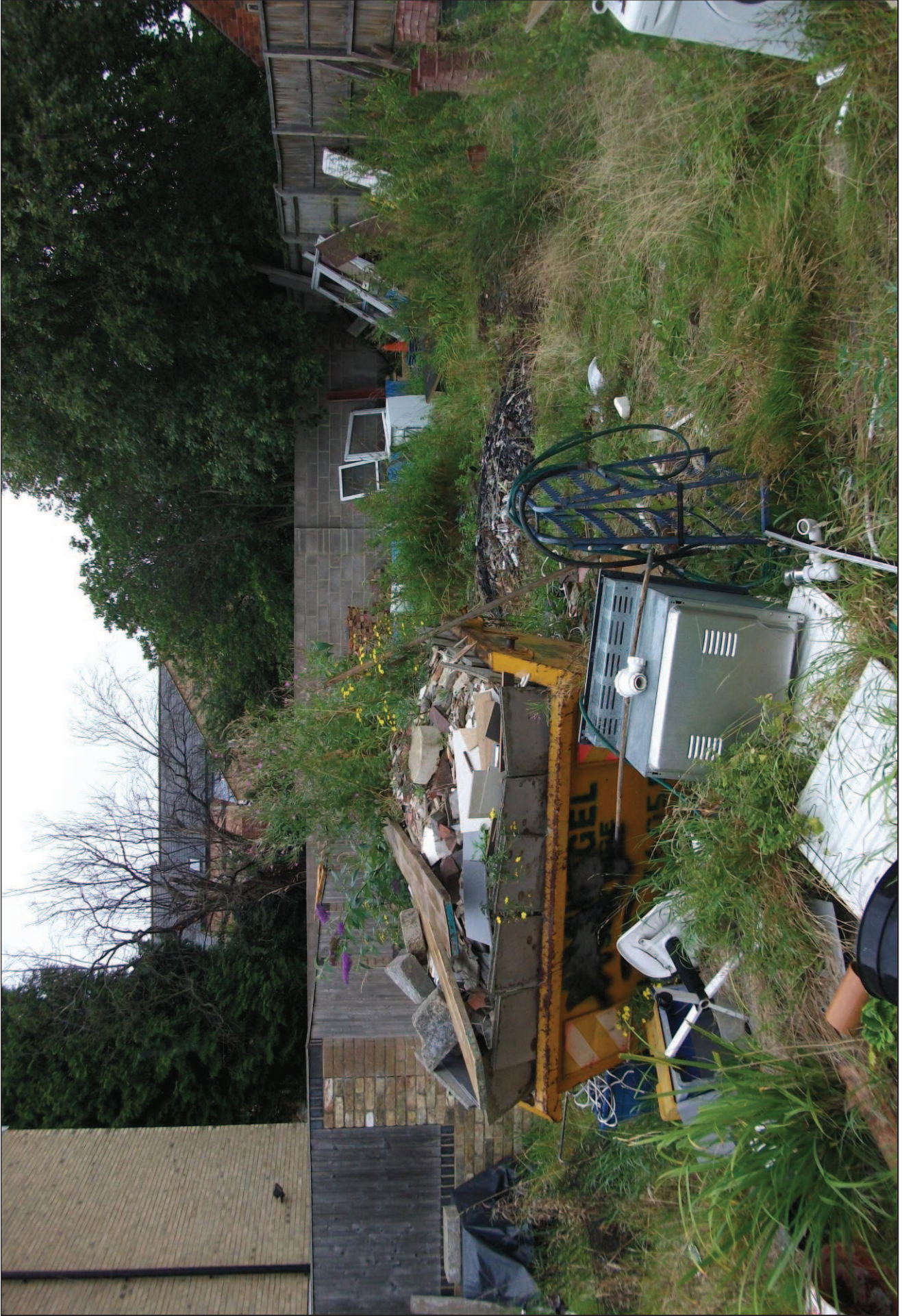
View of inside of parcel of land to the rear of 229-233 Cowley Road