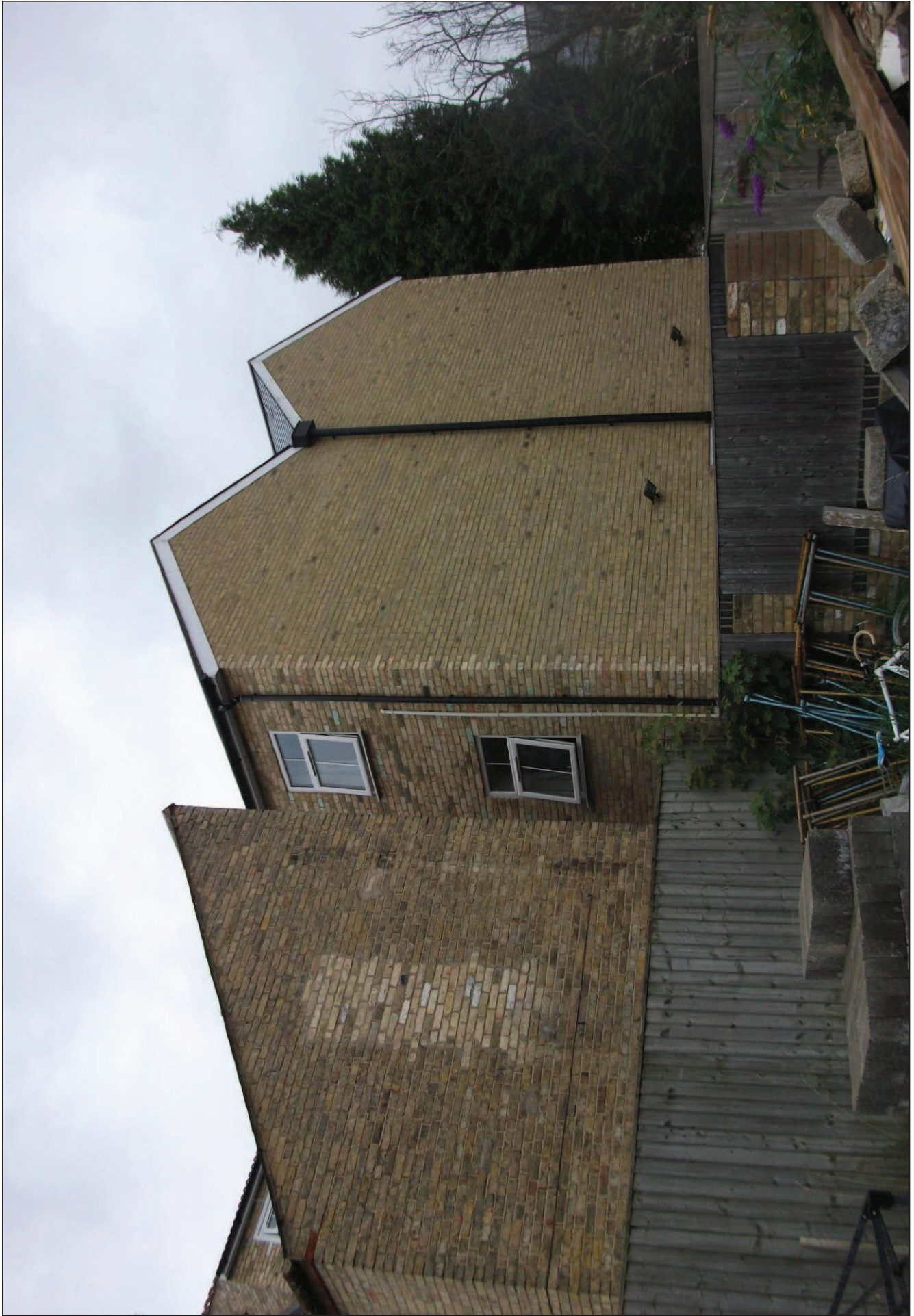
View of rear of 229-233 Cowley Road